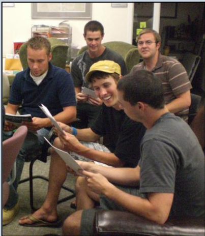
From a meeting of the V-Men committee