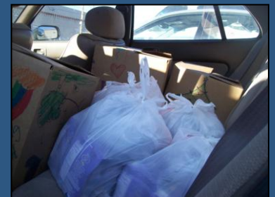
From the U of U / Westminster partnership service day 9/19

Can't help that day? There are many more Kostopulos events that could use your help. Visit us for more information!