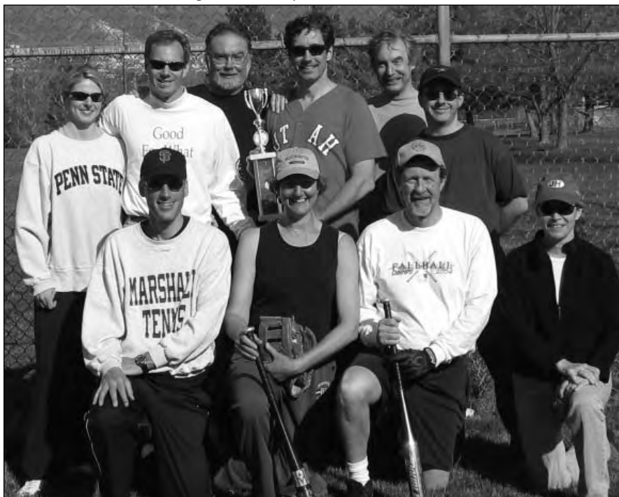
The gloating winning team