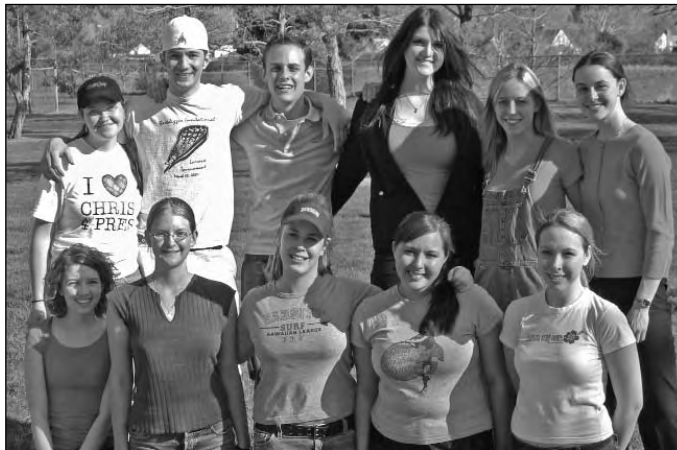
The second place team, who deserved to be first