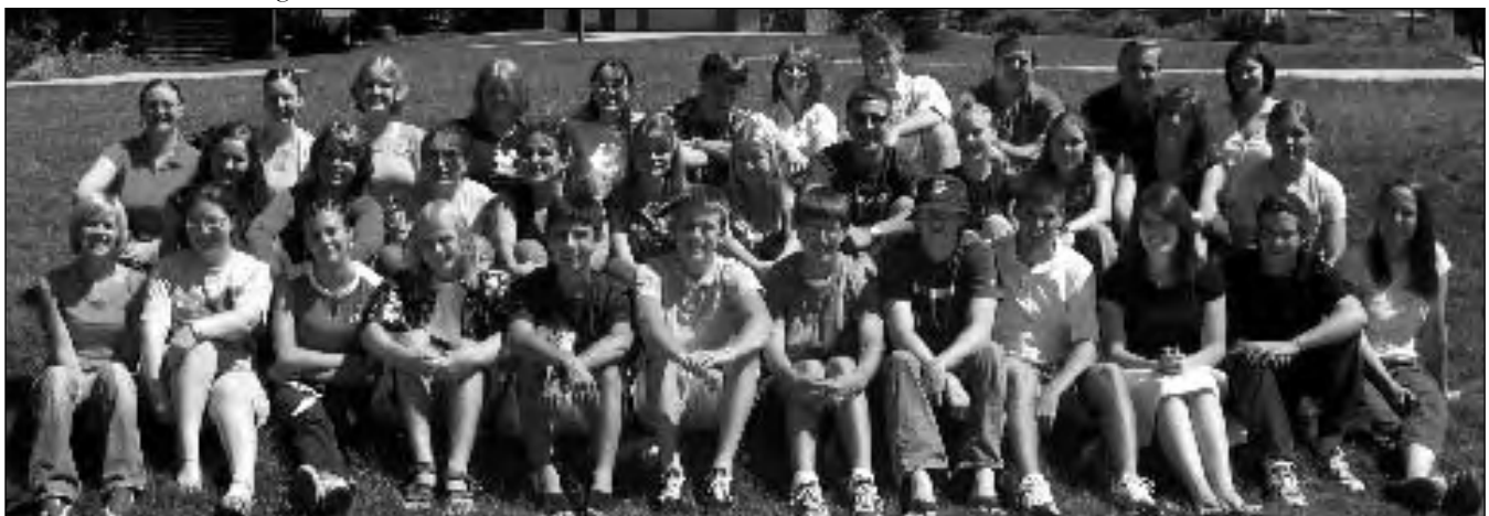
The incoming Honors class takes a break from orientation activities